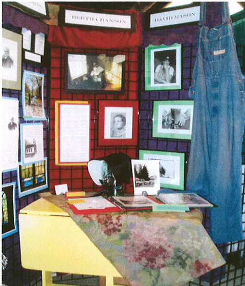
VT History Expo Exhibit